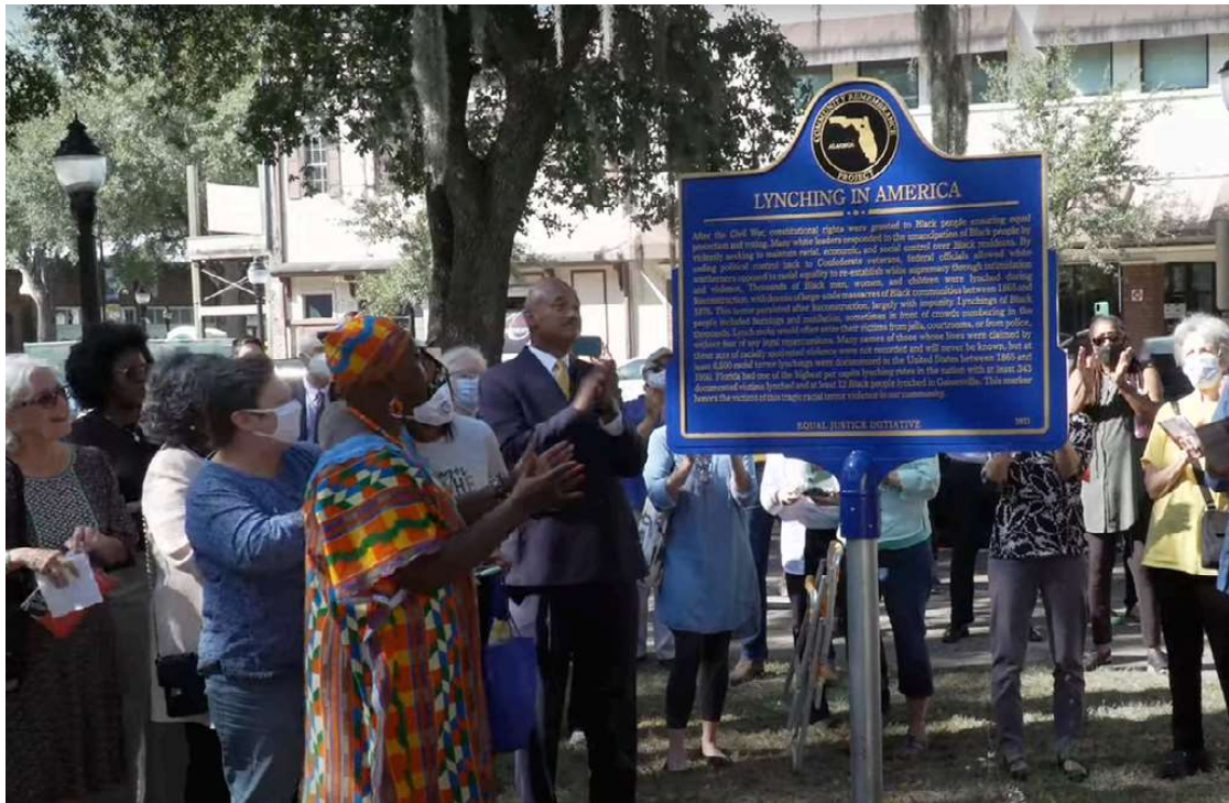
Alachua County and community leaders unveil a “Lynching in America” historical marker at the county’s administration building in Gainesville, Florida on Oct. 23, 2021.